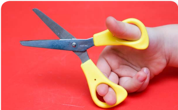
1. Open and shut scissors