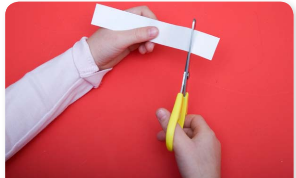
2. Snip paper