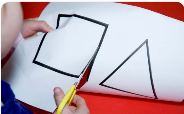
5. Cut out shapes