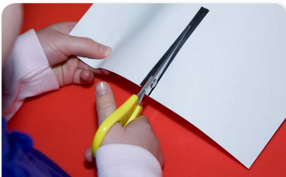
3. Cut along a straight line