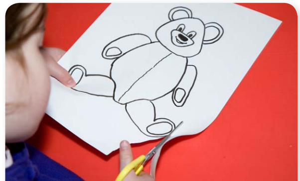
6. Cut out simple pictures