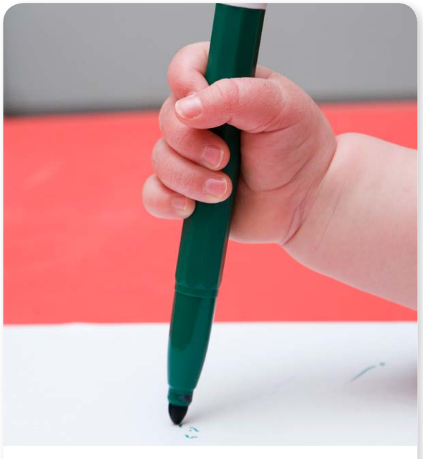
Hold in the fist