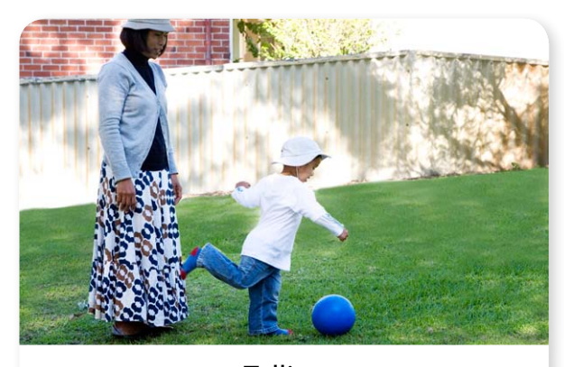
Telling Say, "Leg back, kick"