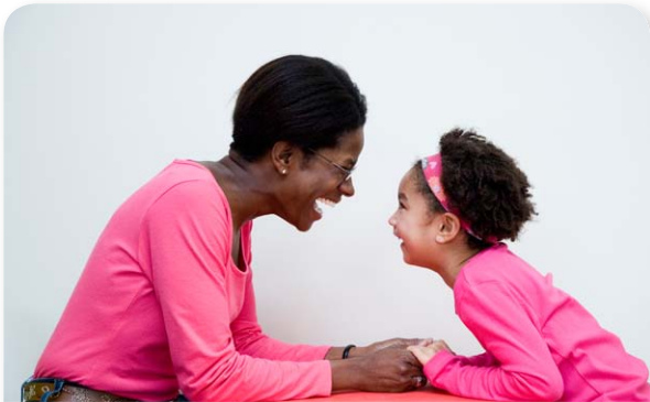
Give positive attention