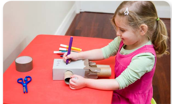
Provide activities that interest your child