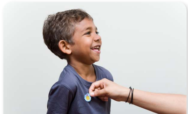
Reward good behaviour