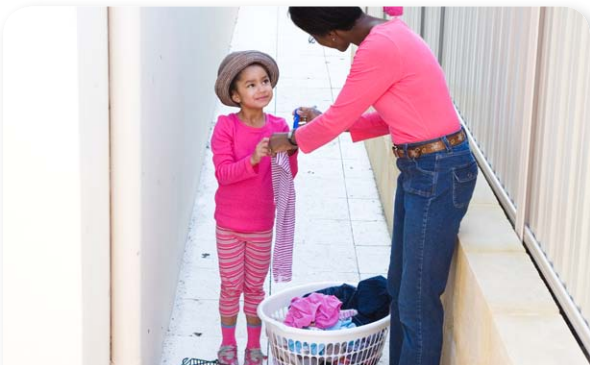
Give specific praise e.g. "Great helping "