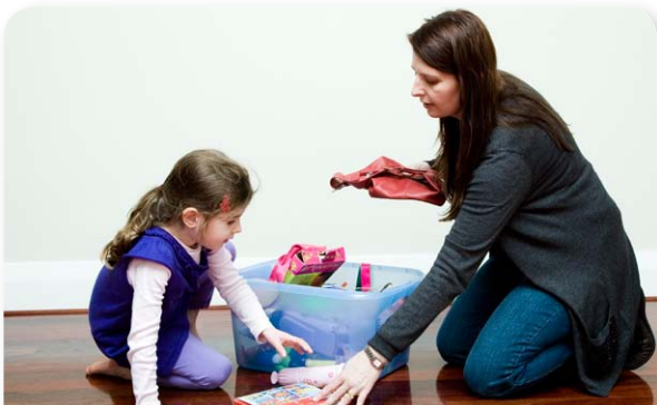
Set a good example e.g. pack away together