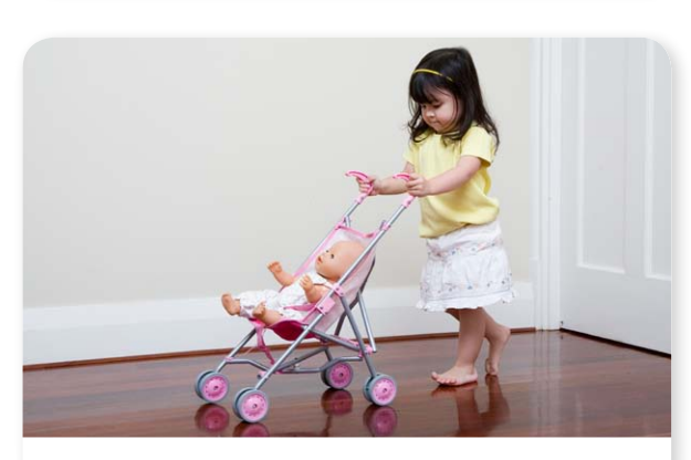
Push a pram