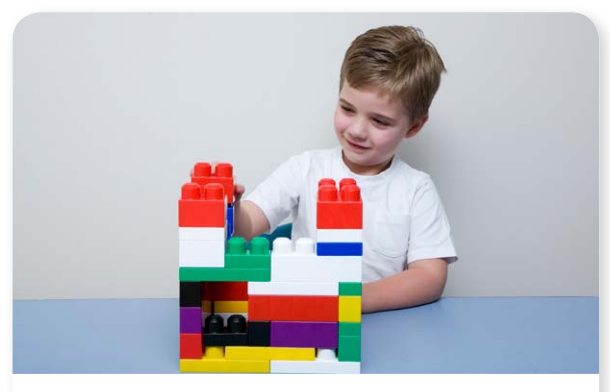
Build with blocks