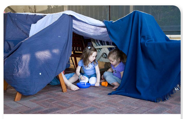
Build a cubby