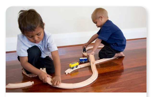
Build a train track