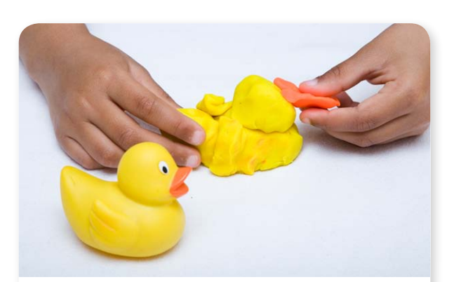
Make things with playdough